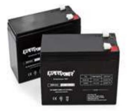
Figure 1. SLA Rechargeable Battery (GPP1272)

The battery used in this study is shown in figure 1.