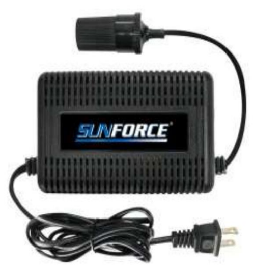
Figure 2. AC/DC Adopter

It converts the AC source into DC to charge the battery. Adapter for battery power equipment may described as chargers as shown in figure 2.